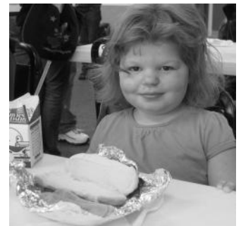
Say Ham & Cheese!

We are one of 24 sites the CAPC has set up in Jefferson County to provide summer meals.