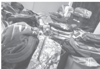
Look at all of those backpacks waiting for a young person...

When we needed notebooks, you brought notebooks. When we needed pencils, rulers and glue, you brought those items. Your intuitive giving is truly a sign of our blessed calling to work together to better our community.