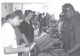
...here are some of the kids, grateful for your generosity.