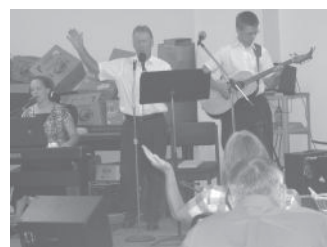
The Honey O's on Sept. 16