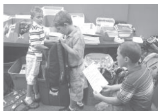
Three of our lemonade boys spent an afternoon stuffing supplies